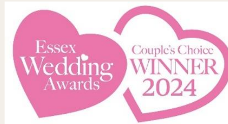
Couples Choice Wedding Venue of the Year