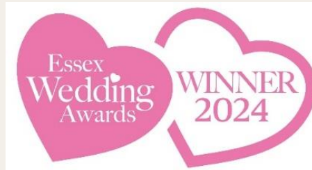
Wedding Venue of the Year