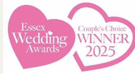
Couples Choice Wedding Venue of the Year